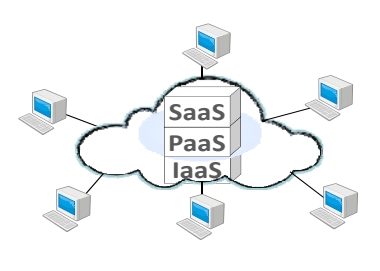
Figure 1. Cloud Service

In this study, there are a number of advantages of applying Cloud Computing for the fire evacuation system, namely higher processing speed, larger storage memory, less risk when fire takes place, lower related cost, and higher capability for integration.